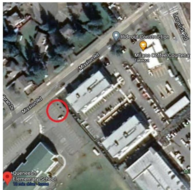
Figure 2 - Queneesh School

Except for Monday morning 10:30 pickup at Driftwood Mall and Friday morning 9:00 pickup at Strathcona Park Lodge, all times will be dependent on whether or not campers require all pickup locations. Your camp coordinators will confirm when everyone lets them know their travel plans.